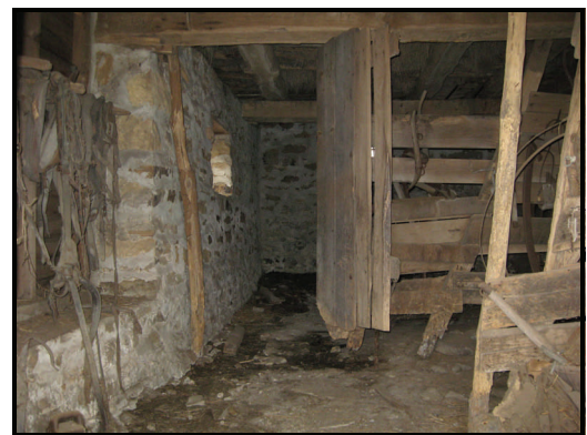
Inside the Evergreen Barn

In addition, private tours are available upon request.