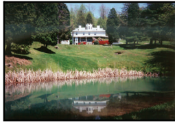
EVERGREEN HERITAGE CENTER