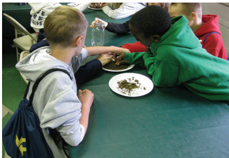
7th Graders Analyzing Soil Samples

For more information, please call us on 301-687-0664 or email us at foundation@evergreenheritagecenter.org .