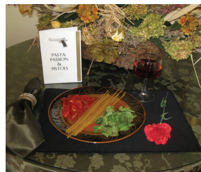
An evening of murder and mystery— who “killed” Pepi Roni?

During the mystery, patrons sipped wine and dined on a four course Italian dinner. The well-attended event and its silent auction raised more than $3400, which will be used as matching funds for the Foundation’s grant from the Rural Maryland Council, supporting the Foundation’s spring environmental education program.