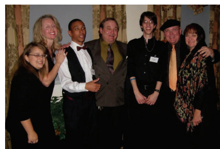
The cast of “Pasta, Passion and Pistols”