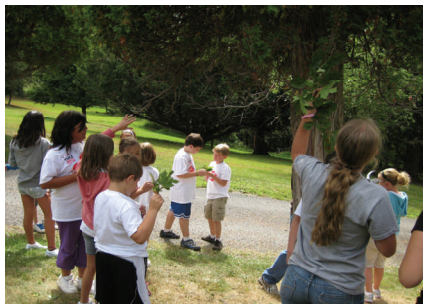
YMCA Children Collecting and Identifying Leaves